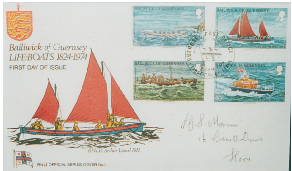
Photo of a cover on display at the Cromer RNLI museum, Norfolk, U.K.

As commercial pressures and the sizes of trading ships increased in the late 1700's and early 1800's, there was a corresponding increase in the number of shipwrecks and loss of life at sea. Some coastal municipalities did sponsor some life saving efforts but drowning at sea was widely considered an occupational hazard of being a sailor.